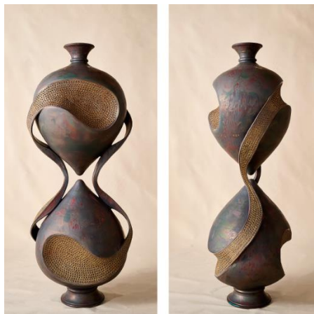
Front and side views of Hourglass , 2023, an earthenware sculpture inspired by Egyptian water filters, exploring the concept of inner and outer beauty, 55.5 x 22 x 22 in.

Upon examination, the pieces in the series appear somehow inverted. This is deliberate, a riff on a design conceit that solidified Said’s place on the international map not long after his arrival in the United States: a preoccupation with the relationship between the inside and the outside.